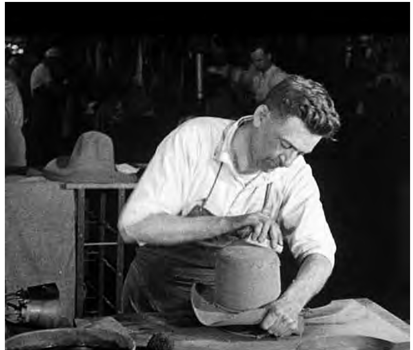
Birth of a Hat (Stetson Company, ca. 1920)

The National Film Preservation Foundation salutes UCLA Film & Television Archive for its participation in the collaboration with the New Zealand Film Archive, through which lost American films are being preserved and made available to audiences once again.