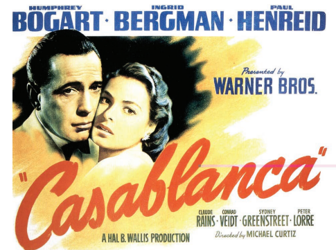
Above: Marty Cooper's favorite movie is Casablanca, a 1942 production, directed by Michael Curtiz, screenplay by Julius J. and Philip G. Epstein and Howard Koch.

“This movie is one of that era's few films that was made before we knew who was going to win the war, which adds to its interest.” ~Marty Cooper